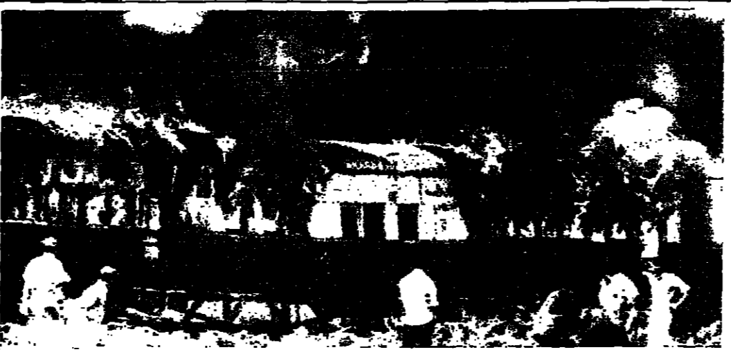
FIRE UNCHECKED -- Fire runs unchecked through carriages of local train in Karachi Wednesday after it was fired by strikers. Two strikers were killed when the train ran into them as they tried to halt all trains on the Landhi-Karachi section of the government's railroad system.

Kuwaiti officials said they would be willing to sell gas to the U.S. from a new one billion dollar gas liquefaction plant if the situation changed.